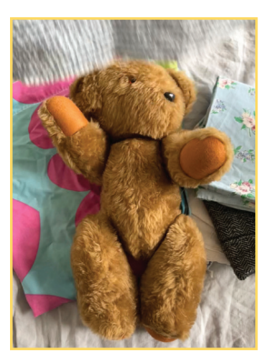
Adult supervision is essential. Involve and talk with your child as much as possible.